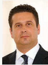
Edward Zammit Lewis Minister for Tourism

“Malta is a natural market for U.K. tourists,” he says. “Currently, the U.K. accounts for around one-third of the total number of visitors, and as many as 50% of them come back. Malta is an attractive destination for many reasons: It has an extensive leisure offering, safety, a cosmopolitan lifestyle and the presence of important industries.