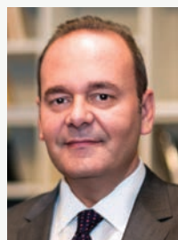
Christian Cardona Minister for the Economy, Investment and Small Business

Economy, Investment and Small Business Minister Cardona knows that this needs to continue if Malta is to keep attracting the industry’s bigger players, while looking to create synergies with other sectors.