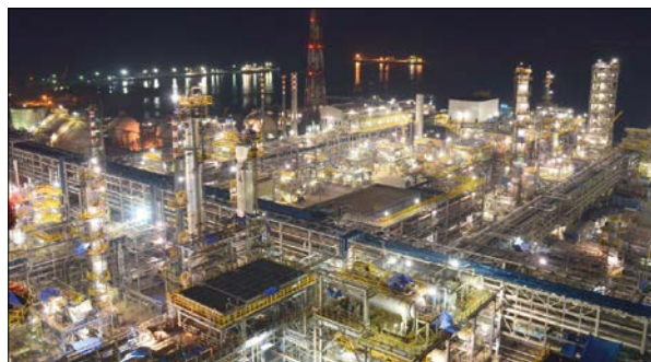
Petron Bataan Refinery.

Petron Corporation is the Philippines’ largest oil refining and marketing company, and thanks to a $2 billion investment in its Bataan refinery, is now one of the most technologically-advanced in Asia as well.