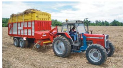
Field Logistics for Biomass Power Generation