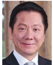
Andrew L. Tan Chairman and CEO, Megaworld

Demand for Megaworld's trend-setting communities continues to be robust, putting the company in a strong position to sustain the long-term growth of its business. "There are many areas for growth in the Philippines, especially in the real estate sector," Tan says. "We are excited about what we as a company can do to move our economy forward."