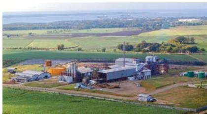
San Carlos BioEnergy Sugar, Ethanol and Power Plant