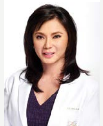
Dr. Vicki Belo Founder and CEO Belo Medical Group

Belo Medical Group | info@belomed.com | www.belomed.com