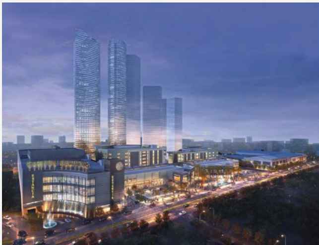
Capitol Commons, Ortigas.