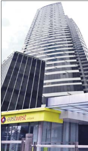
EastWest Bank headquarters at The Beaufort.

As Gotianun says, "We are currently building the largest power plant in the Mindanao region—a 405 MW plant to shore up the underserved power requirements in the area. Power gives the group the diversification needed for more stability in revenues and earnings."