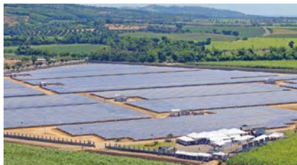
San Carlos Solar Energy Phase 1 (22MW)