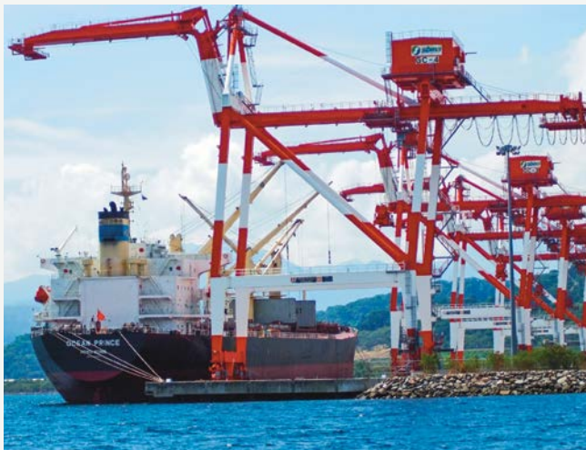
Subic Bay Freeport international container terminal.