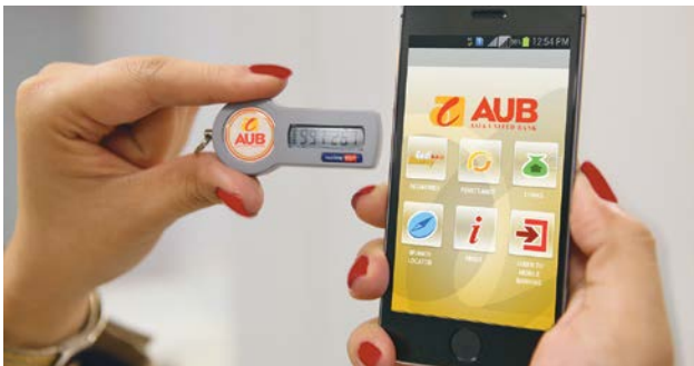
Continuously pushing the boundaries of Philippine banking for the past 16 years

An initial public offering in 2013 that raised $170 million (PHP7.44 billion) is funding its aggressive lending business, branch expansion, and information technology infrastructure upgrade. To date, AUB has been able to grow its loan portfolio at an average of 25.3% for the past three years, and expects its branch network to reach 223 by the end of 2014.