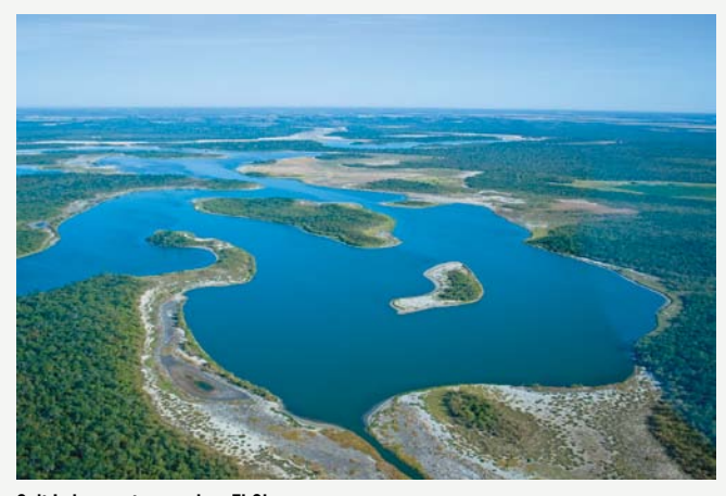
Salt Lake, western region, El Chaco