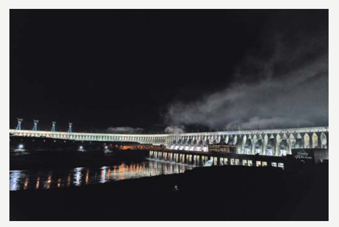
Monumental illumination of the Itaipu Binacional Dam

of building eco-lodges and hotels with exploration and recreation activities is endless. About 900 kilometers from Asunción, on the Black River in the north of the country, the Pantanal has already attracted a U.S. and European clientele.