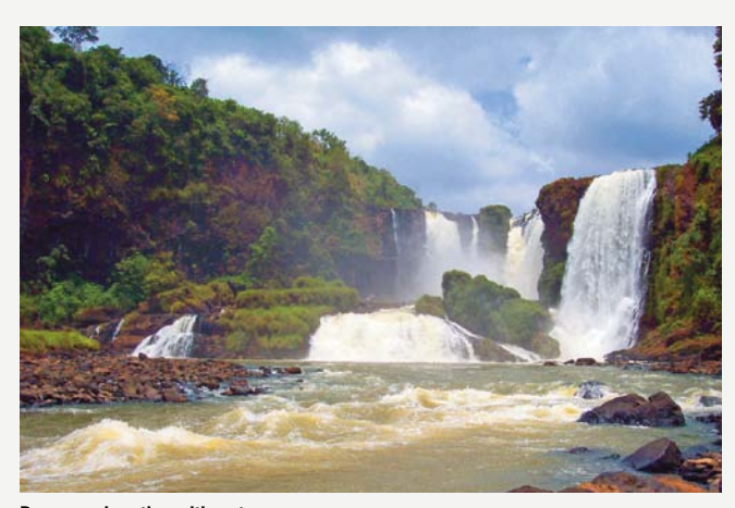
Paraguay, bursting with water resources

their early 20s, with help from the Inter-American Development Bank (IDB) and U.S. AID. What started as a native herb- and spice-producing venture to get more women into work and give people an alternative crop to grow so that they didn't have to flock to the cities, or grow marijuana, is now a multimillion-dollar company.