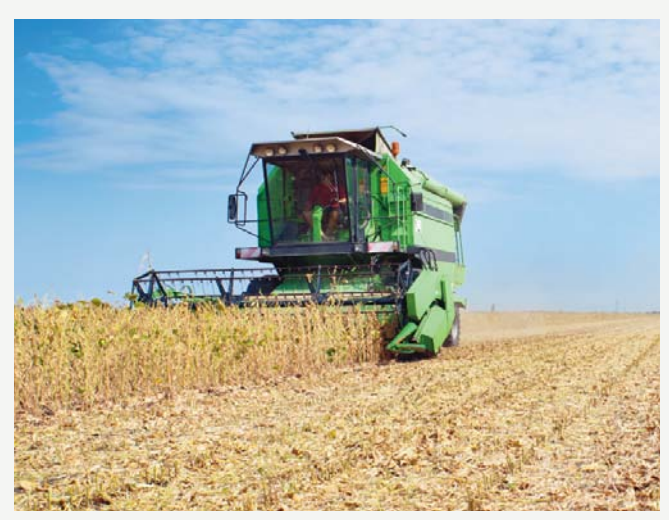
The soybean, Paraguay's principal export

Meanwhile, agriculture has proven to be the most important sector in