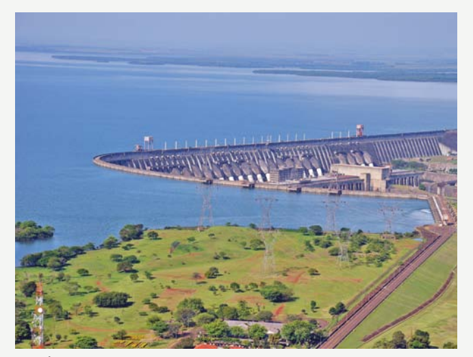
Paraná River with Itaipu Dam

"The nonperforming loan rate is relatively low, at less than 3%, and while banking penetration used to be only 20%, it has now risen to over 40% in relation to the GDP. The financial system is fairly solid, but placement of sovereign bonds has proved to be a fundamental step in underlining Paraguay's global presence."