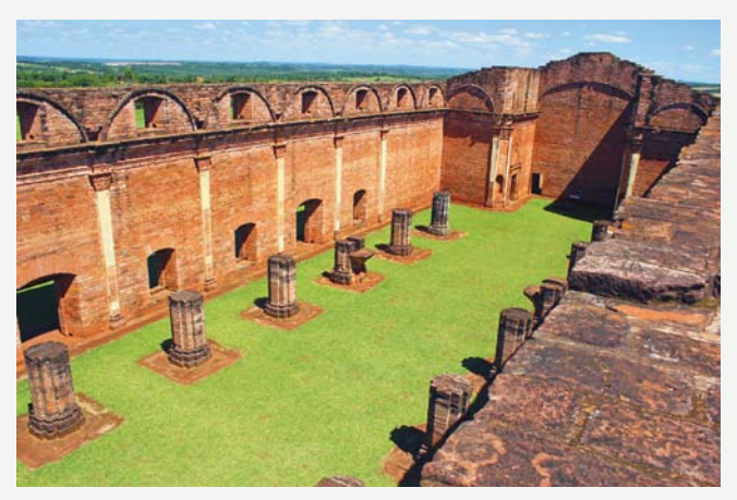
Jesuit Mission of Jesús de Tavarangué