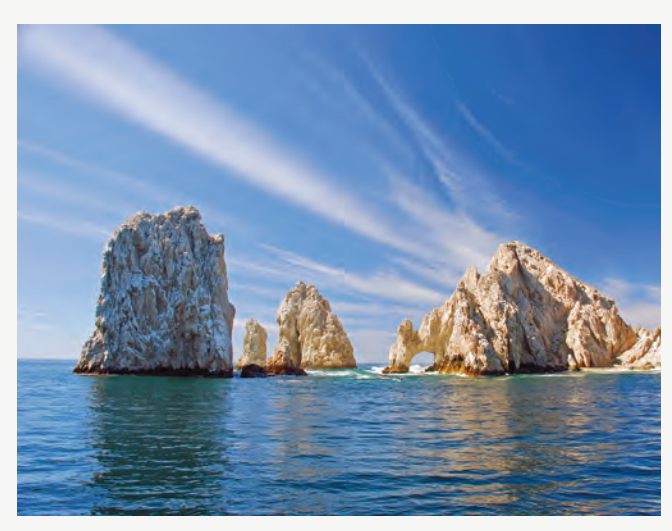
The Arch. www.visitloscabos.travel

Located at the tip of the Baja California Peninsula, Los Cabos is flanked by the Pacific Ocean and the Sea of Cortez, and its landscape comprises a rare mix of desert and ocean.