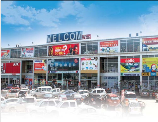
The largest variety of products in one destination! Melcom... Where Ghana Shops.