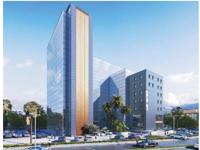
IPMC: Ghana’s leading IT company

Banking is also a fast-growing sector and one the Finance Minister is passionate about developing as a lot of financing for large infrastructure projects still comes from outside Ghana. “We need banking as an investment vehicle for domestic and international business,” he says. “We want to encourage more financing and eventually establish ourselves as a financial center.”