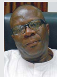
Hon. Amin Amidu Sulemani Minister of Roads and Highways

“The road development projects facilitate the movement of people, goods and services in all sectors of the economy, including tourism, mining, health, trade, education and agriculture amongst others, and by this means, decentralize the country,” Roads and Highways Minister Amin Amidu Sulemani says. “Ghana offers an excellent investment climate, a solid legislative framework, and a peaceful and democratic system.”