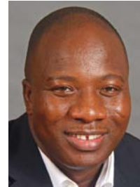
Hon. Mahama Ayariga Minister of Information and Media Relations