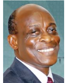
Hon. Seth Emmanuel Tekper Minister of Finance and Economic Planning

brands has contributed immensely to consumer perception amongst our people that Ghana products and brands are of inferior quality to foreign brands and products. It is really important for us to build strong brands of Ghanaian origin, to get the domestic market consuming these, and then gaining value-added entry to the international market.”