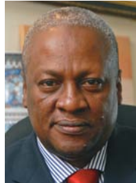
H.E. John Dramani Mahama President