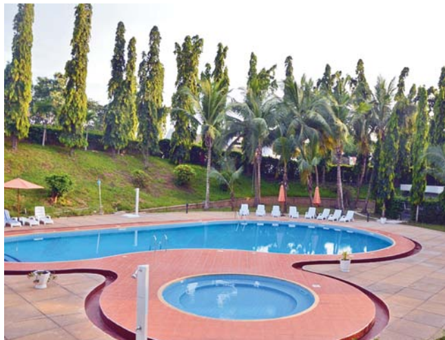
Welcome to a memorable stay at Volta Hotel Akosombo.

For this to become a reality, the utility executive is keen to see more PPPs. "We want private investors to come in with much-needed capi-