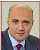
Dimitri Gvindadze Minister of Finance