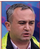
Alexander Khetaguri Minister of Energy and Natural Resources

dream of becoming a Europe-Asia hub fulfilled sooner rather than later.