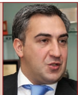
Nika Gilauri Prime Minister