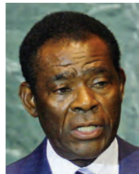
Obiang Nguema Mbasogo President

At the meeting, President Obiang said: “Nearly 20 years ago, I made my first visit to Houston. At that time, Equatorial Guinea was the poorest country on the continent. I came here and met with American business-