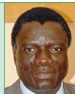
Maxwell Mwale Minister of Mines & Minerals Development