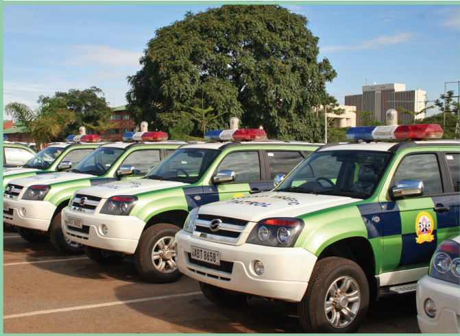
Facilitating an efficient and safer transport system in Zambia. www.rtsa.org.zm

An indigenous and forward-thinking business, I.C.C. is finalizing a strategic partnership with a Tanzanian investor that will give it U.S.$20 million in equity and debt in Q1 2010 and provide it with valuable ammunition in the battle with larger international banks.