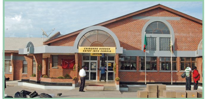
Golden business opportunities exist across the fast-growing Zambian economy.