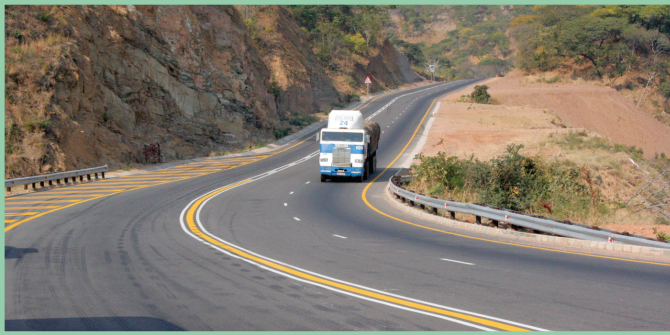
Zambia is inviting tenders for major infrastructure projects such as new roads.