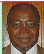
Situmbeko Musokotwane Minister of Finance and National Planning

Having gained independence from the U.K. in 1964, Zambia's ties with British companies are strong, as reflected in the number of U.K. firms already present in Zambia's industries and business sectors. With the discovery of oil and gas residues, the Zambian government is now inviting bids for a