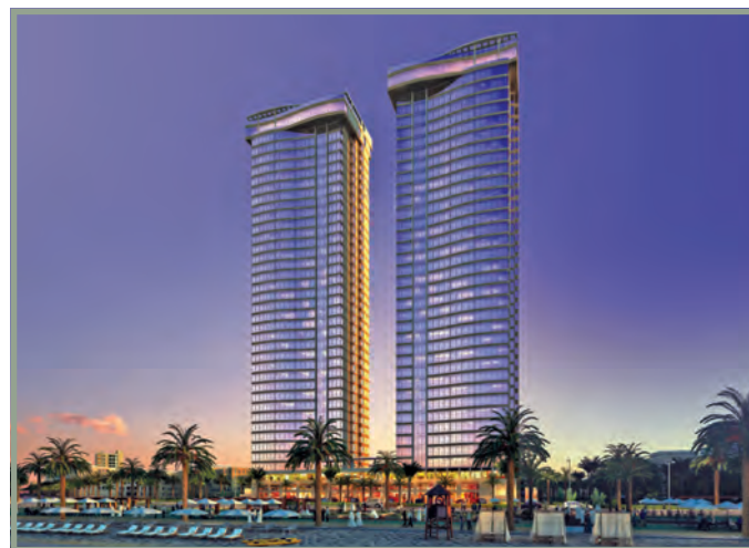
Farsi Seven. New waterfront development by Zaki Farsi Group. www.zakifarsigroup.com

"We are a one-stop shop. Our mandate, structure and regulations are on our website and all the information any company wishing to export to Saudi Arabia needs to know is clear and transparent."