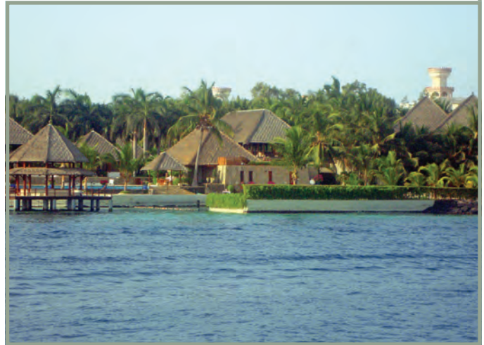
Saudi's tourism sector has huge potential.

Recently restructured and with 20 years' local experience in the market, Tasweegar is another local company looking to be the partner of choice for U.K. and other international inves-