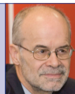
Antoni Castells Minister of Economy and Finance