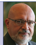
Josep Huguet Minister of Innovation, Universities and Business

This dynamic economic model is moving the city forward at a rapid pace as it invests hundreds of millions of dollars in modern transport and ICT infrastructure that will act as the foundations for future growth. In 2009, a stunning new passenger terminal opened at the busy international airport to welcome additional long-haul flights.