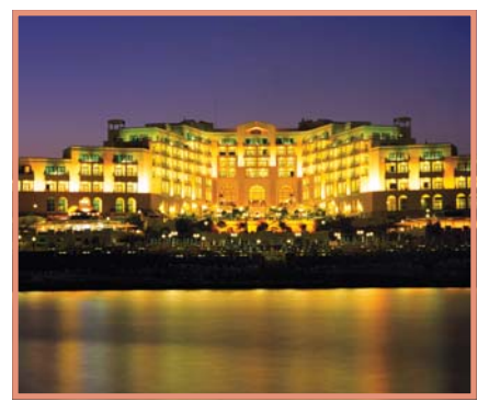
Corinthia Hotel, St George's Bay.

Another area experiencing major growth and continually diversifying is manufacturing, with areas like the car component industry and the pharmaceutical sector gaining weight. IT is also set to dramatically develop, with the opening next year of the first SmartCity