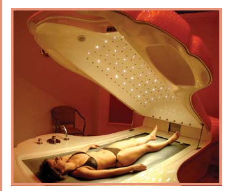
Fortina Spa Resort www.FortinaSpaResort.com

berth marina." Property will be on sale from 2010, with commercial investment possibilities now available.