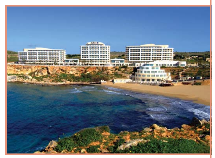
Radisson SAS Golden Sands Resort & Spa, Malta. www.goldensands.com.mt

For further information kindly contact us on: (+356) 2065 5510 or Email: info@tignepoint.com