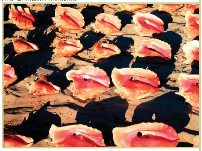
More than a million conch are exported every year