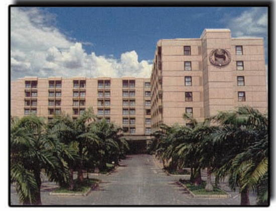
SHERATON LAGOS HOTEL & TOWERS

At Ikeja Hotel PLC, we have come a long way. We started with elegant Sheraton Lagos Hotel & Towers, and later consolidated with historic Federal Palace Hotel and Suites. With Abuja Sheraton Hotel and Towers now in the family, our testimony of hospitality excellence is further strengthened.