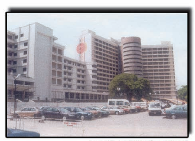
FEDERAL PALACE HOTEL & SUITES

At Ikeja Hotel PLC, we have come a long way. We started with elegant Sheraton Lagos Hotel & Towers, and later consolidated with historic Federal Palace Hotel and Suites. With Abuja Sheraton Hotel and Towers now in the family, our testimony of hospitality excellence is further strengthened.