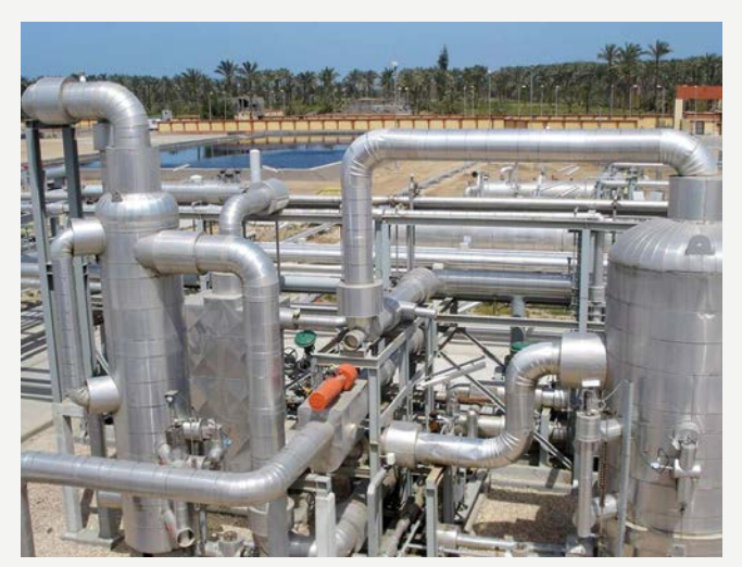
Dana Gas Egypt's El Wastani gas-processing facilities in the Nile Delta.

The media, and the role of journalism in particular, are vital in a progressive and modern society: and national newspaper Al-Ahram has for 140 years played a significant role in ringing the changes. And it is looking forward to harnessing development and enlightenment in the society for centuries to come. Editor-in-chief Mohamed Abdel-Hady Allam issued the following statement: "In the last three years, the government has shown unprecedented cohesion and determination in implementing a new constitution to complete building a modern and democratic state. The nature of the constitution is to maintain public freedoms and safeguard the homeland against any threats that would jeopardize national unity. The burden on the shoulders of the interim authority was immense, and when President al-Sisi came to power, it was clear he had a lot of work to do. The new administration has adopted a solid approach to revamping the infrastructure, roads, sewage systems, public