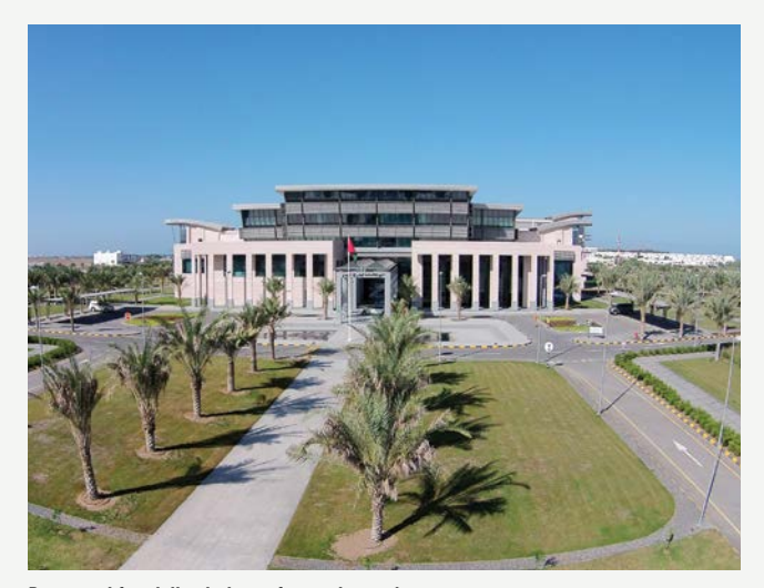
Renowned for civil aviation safety and security.