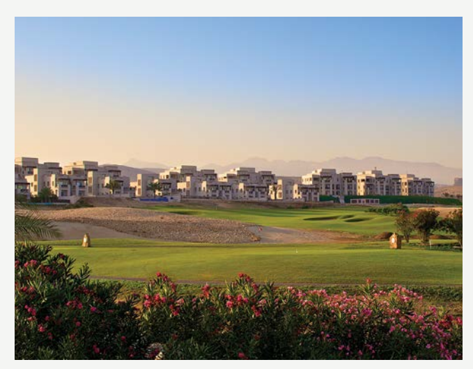
Luxury residences in Muscat Hills.