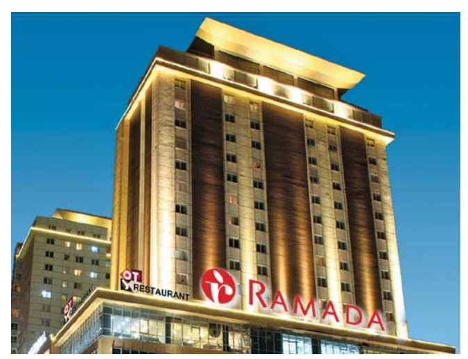
"Best hotel in Mongolia - recommended by Trip Advisor"

"Our priority is to get spending under control, and with the state budget sustainability law, we should be able to accomplish this effectively," says Minister of Finance Chultem Ulaan. "Fiscal loss should not be more than 2% of GDP. The percentage of total expenditure growth rate for the year should not exceed either the percentage of GDP from non-mining activities or the average rate of GDP growth from the non-mining sector of the last 12 years. This way we should get inflation down. Last year it was 14%, which is obviously not sustainable. Greater value addition is also going to be promoted inside