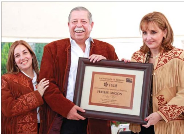
Governor of Tamaulipas Egidio Torre and his wife with Minister of Tourism Gloria Guevara

for Tourism is part of that great countrywide dialogue.”