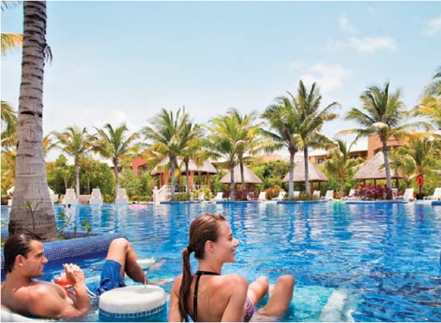
Barceló Maya Palace Deluxe, Riviera Maya.