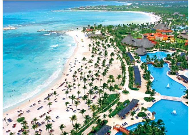
Barceló Maya Beach Resort, Riviera Maya.

"This year the Mayan culture will be celebrating its 5,125th year on December 21. As a result, we are expecting 52 million visitors to come and discover the Mayan Route. Quintana Roo is the gateway to