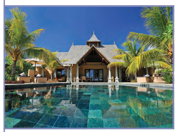
Maradiva Villas Resort & Spa, Wolmar, Mauritius