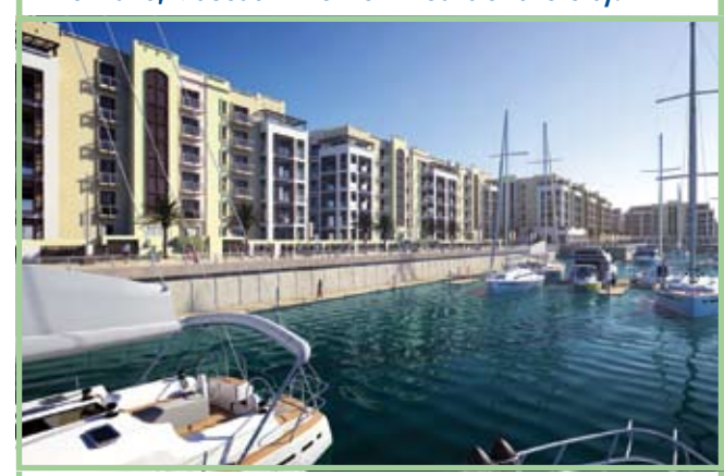
Taking integrated tourism to a whole new level.

Nestled between the cool, clear waters of the Gulf of Oman and the AI Hajr AI Sharyi mountains, Muscat is a cosmopolitan capital with spectacular scenery and stunning beaches—the perfect setting for one of the country's most ambitious and magical property developments.