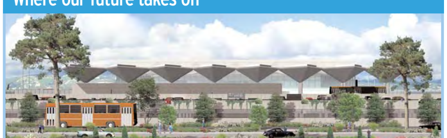
A virtual impression of Guatemala's new La Aurora International Airport