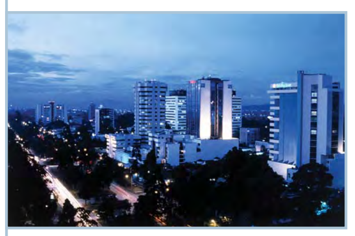
Guatemala City-host of this year's IDB and IIC annual meetings

Technologies to build 100 telephone masts and sold them the land where the sites were to be built, while later organizing the renting of those same sites."