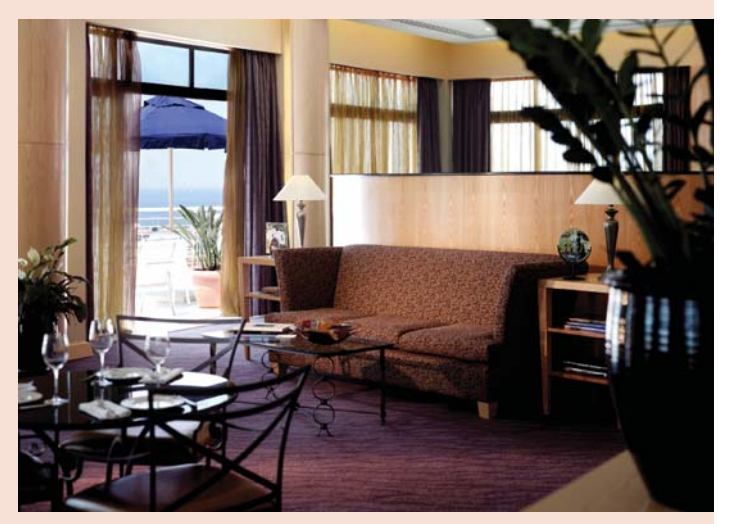
The InterContinental Malta, five-star quality in the heart of the Mediterranean

that in mobile communications, the company is competing against the best global players, including Vodafone, with nearly 50% of the market share in Malta.