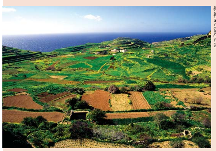
Malta has a rich and varied landscape